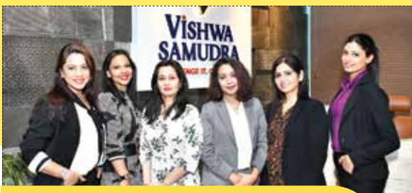
VSE Mumbai Women Employees