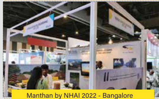
Manthan by NHAH 2022 - Bangalore