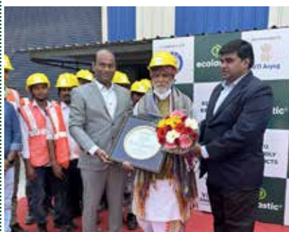
Shree. Ashwini Kumar Choubey, Min. of State for Consumer Affairs, Food & Public Dist. & Environment, Forest & Climate Chnage