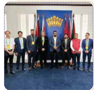
With the President of Guyana - His Excellency, Dr. Mohamed Irfaan Ali

VISHWAN: a name synonymous with the meanings - Nurturing nature, Loving, Caring, Healing, Compassionate, Ambitious, Generous and Protective. VISHWAN will be the medium that connects the VS Family, starting as a bimonthly and transitioning into a monthly magazine.