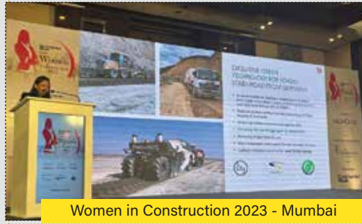
Women in Construction 2023 - Mumbai