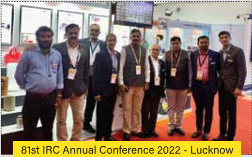
81st IRC Annual Conference 2022 - Lucknow