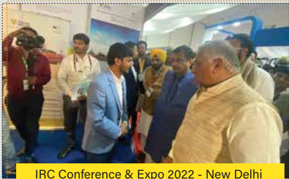
IRC Conference & Expo 2022 - New Delhi