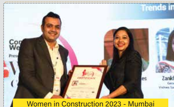
Women in Construction 2023 - Mumbai