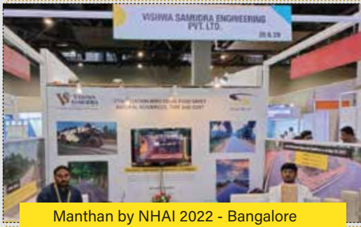
Manthan by NHAH 2022 - Bangalore