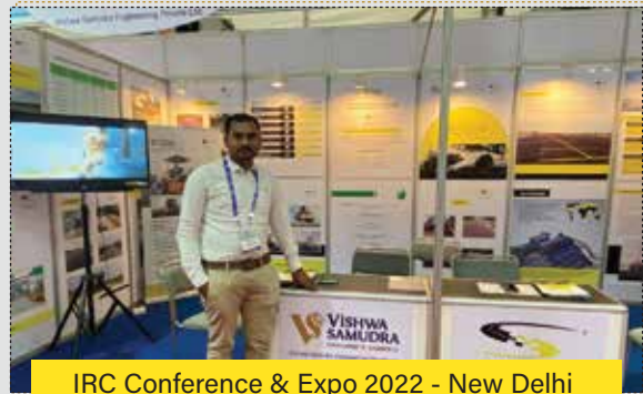
IRC Conference & Expo 2022 - New Delhi