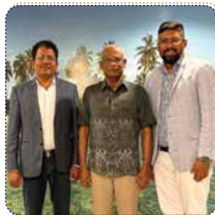
With the President of Maldives - His Excellency Ibrahim Mohamed Solih